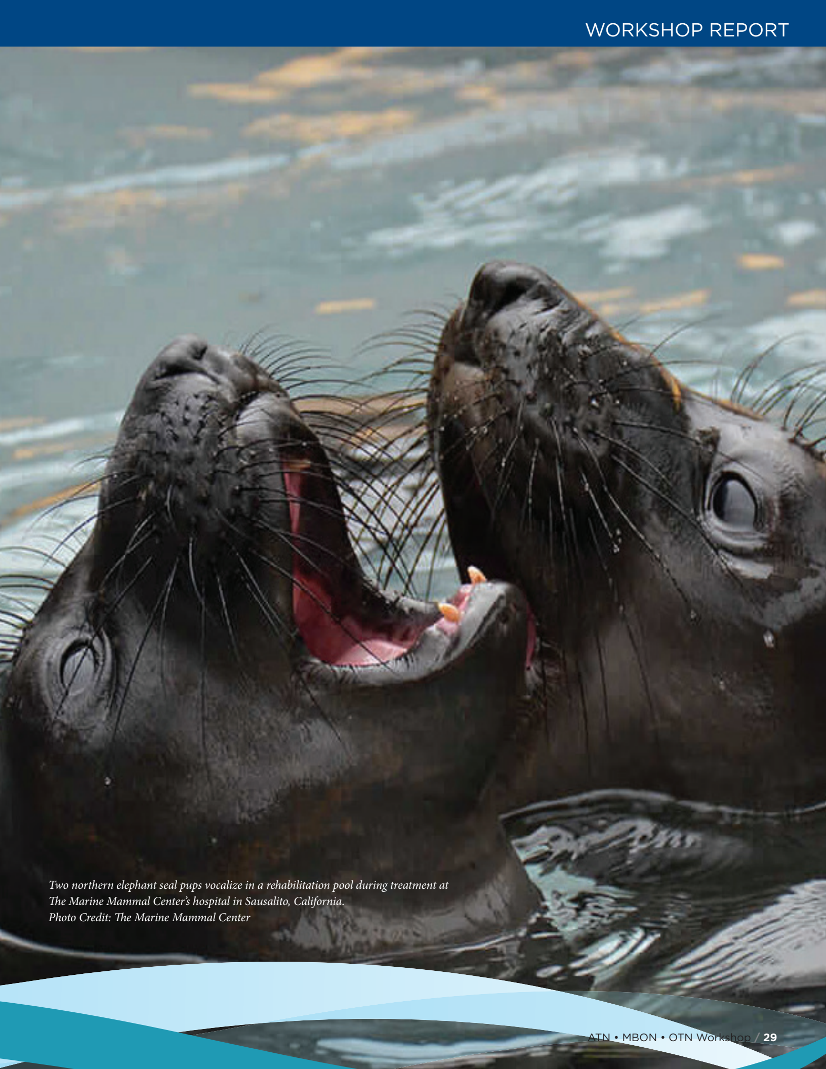
Two northern elephant seal pups vocalize in a rehabilitation pool during treatment at The Marine Mammal Center's hospital in Sausalito, California.