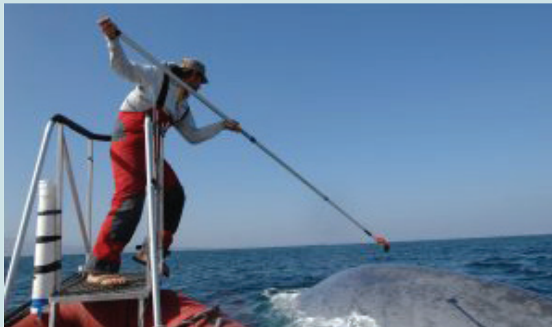
Attaching a motion sensing suction cup tag on a blue whale off the coast of California.