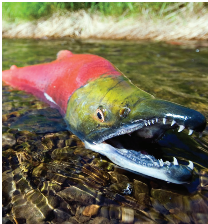
Sockeye salmon.