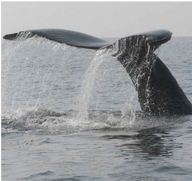
A humpback whale (CRC-15406), about to fluke off of Half Moon Bay, California. Photo Credit: Kiirsten Flynn, Cascadia Research (NMFS Scientific Research Permit #21678 to John Calambokidis).

A total of 60 dart-attached tags have been deployed on blue, fin, and humpback whales with the maximum duration of about 3 weeks on the blue whales.