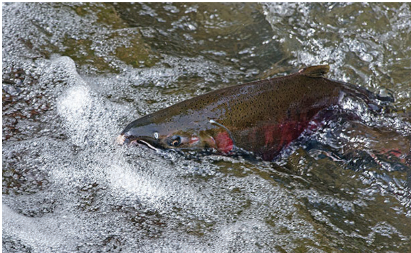
Coho on the Salmon River.

OTN recently renewed funding support for infrastructure for 5 years beginning in 2018 with no obligatory sunset provision. They are adding additional new gliders and receivers, seeking new research funding to pair with their infrastructure (e.g., Strategic Project Grants; SeaMonitor; Industry/OFI, working to enable new Canada International funding), and implementing a new data node for MigraMar (Central, North, and South America).