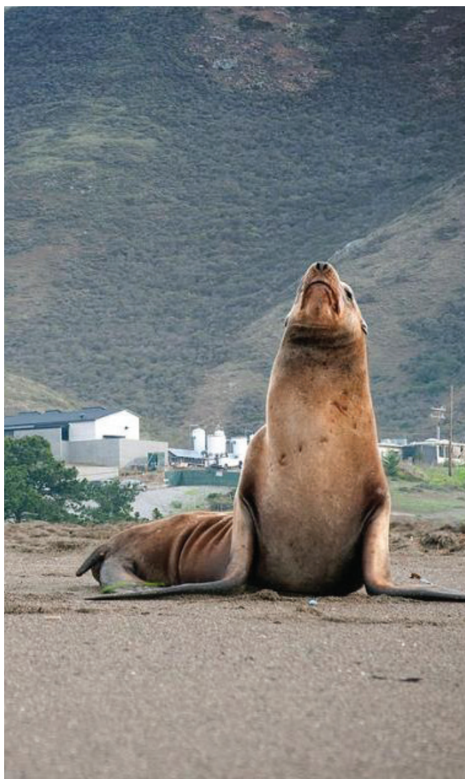
A California sea lion rests on Rodeo Beach in the Marin Headlands with The Marine Mammal Center's hospital visible in the background.

For both the ATN and MBON portals, Axiom utilizes an approach that applies custom services to manage the flow of data throughout the entire data lifecycle—from data creation through to use, reuse, and transformation. Short-term storage and documentation exist for access and sharing by colleagues. Long-term secure archiving exists for preservation and future access and discovery by a larger audience.