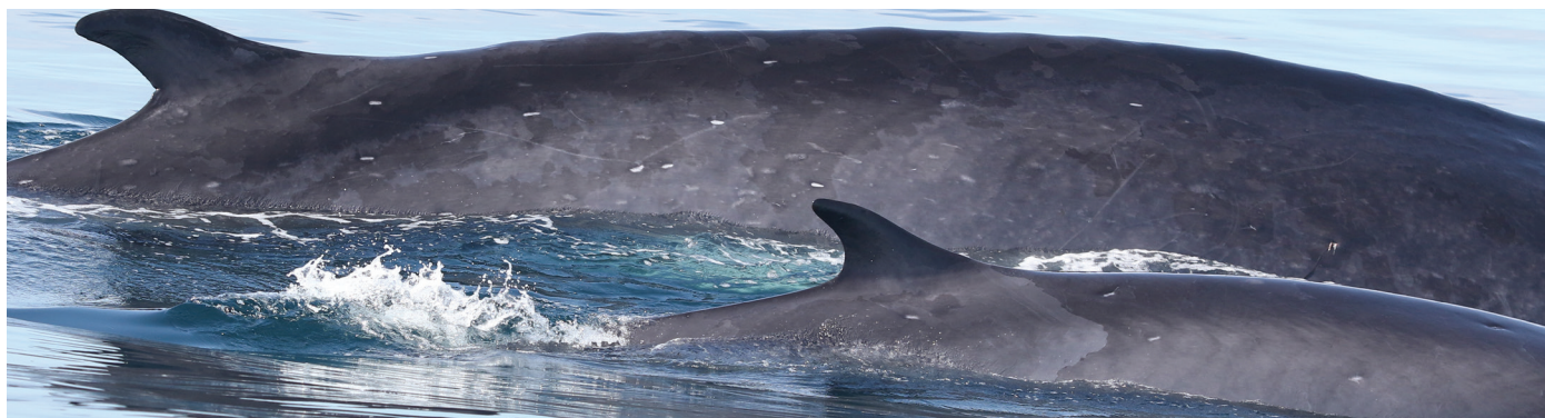
A pair of fin whales off Palos Verdes in Southern California.