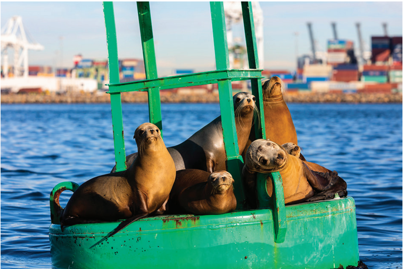
Sea lions on navigation buoy.