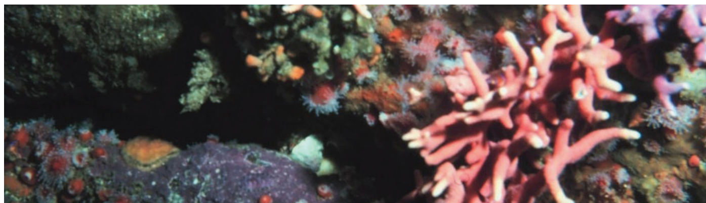
Life on rocky offshore ledges at Monterey Bay National Marine Sanctuary.