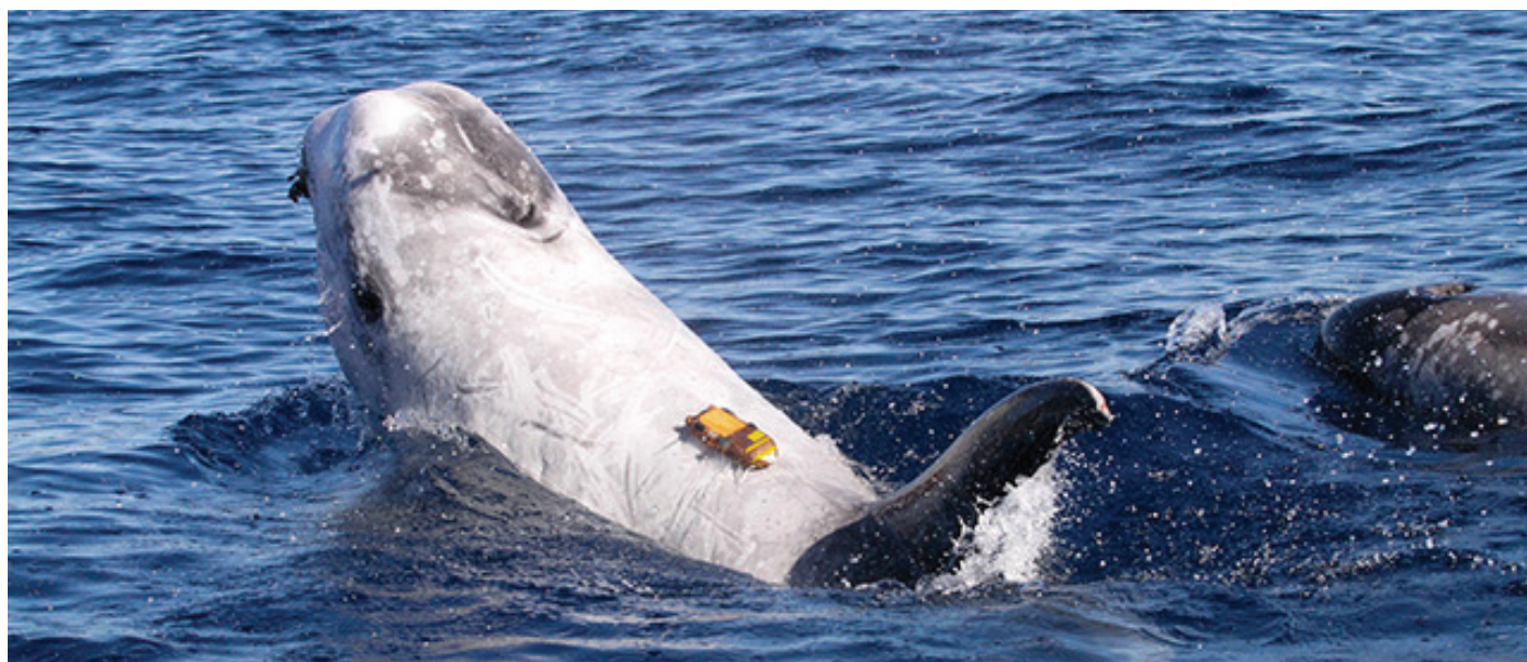
Risso's dolphins outfitted with tags to track their movement and depth. Photo Credit: Brandon Southall (NMFS permit #19116)

The O’Neill Sea Odyssey (OSO) organization educates fourth- through sixth-grade students through hands-on lessons on the relationship between the ocean and the environment. Focusing on underserved schools, OSO covers marine biology, ecology, and navigation. Even though students primarily ask only about marine mammals, OSO would like to use biodiversity and telemetry data to illustrate how food availability and oceanographic conditions are driving what the students are observing from the boat and in the plankton sample. The students collect basic data such as pH, temperature, visibility, depth, and plankton samples from the boat. The OSO would benefit from collaboratively brainstorming with the marine biology community on how to get scientists on board, and how to improve their collection of data and possibly use archival data. Student class size averages per class, totaling 5,276 and more than 100,000 since inception.