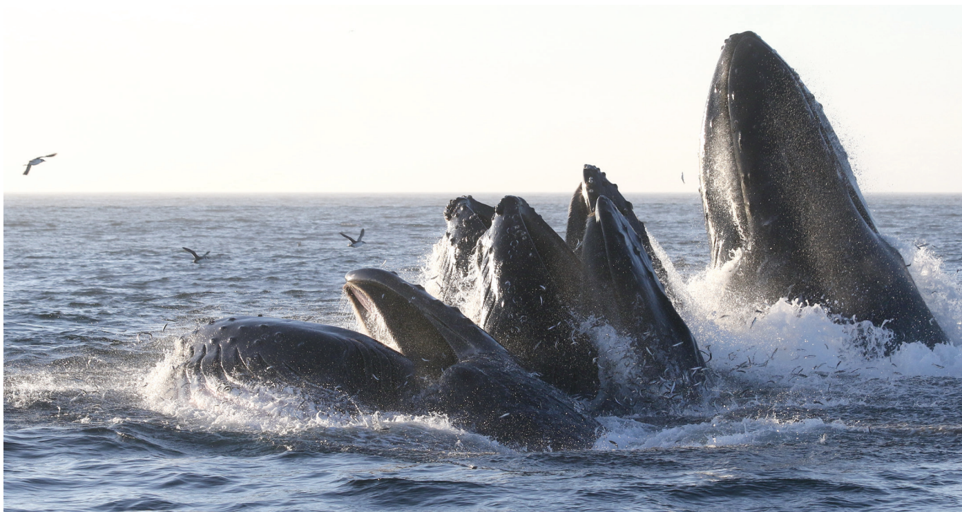
Lunge feeding. Photo Credit: John Calambokidis, Cascadia Research (NMFS Scientific Research Permit #21678)

The focus is to understand the functional and context-dependent responses of marine mammals to change and disturbances, including U.S. Navy sonar and understand the structure and function of marine ecosystems.