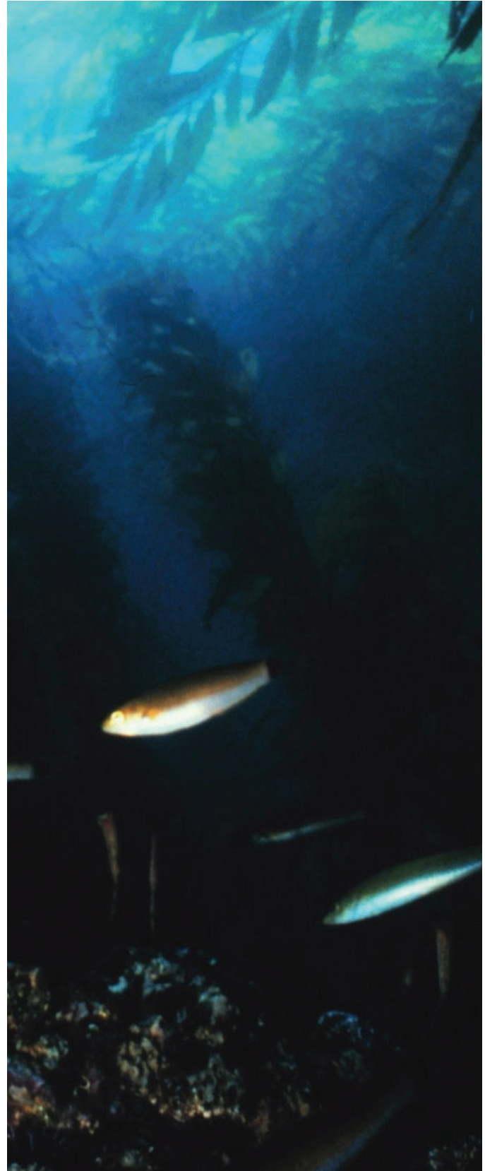
Senorita Fish in a giant kelp forest, Monterey Bay National Marine Sanctuary.