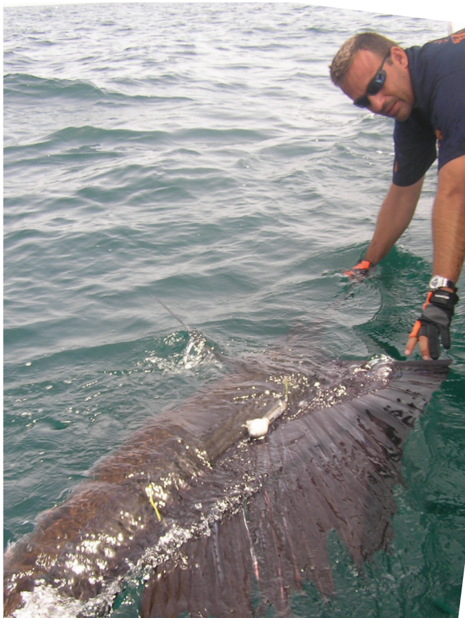
Tagging and placing tracking device on large billfish.

The U.S. IOOS Regional Associations can help close the loop on how the data being collected is making difference institutionally by connecting end-users to researchers to demonstrate how tracking and biologging data are used to make real world policy decisions. U.S. IOOS can convene workshops to integrate acoustics, genomics, and tagging to measure distribution/abundance. High resolution monitoring (including benthic infauna, chemistry, etc. data) along the West Coast enables us to view things at higher resolution by leveraging existing data to better expand information about human impacts.