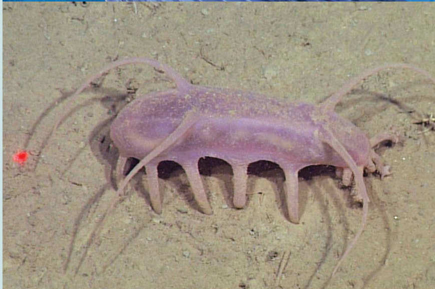
Top: Deep-sea octopuses discovered near Davidson Seamount at 3300 meters. Middle: Tagging and placing tracking device on large billfish. Bottom: Scootplanes globosa sea cucumbers on the seafloor at Station M off the Central California Coast.