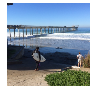
King tide comes to La Jolla