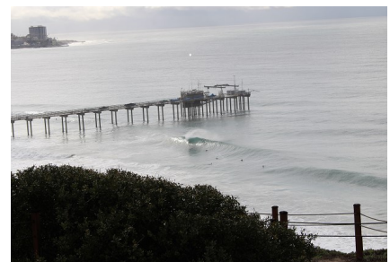
Big surf events dominate Nov & Dec