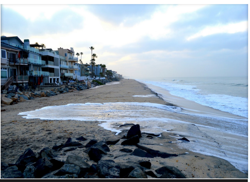
Oceanside Blvd Jan 3, 2014

Check out the <u>California King Tides</u> <u>Project</u> for more information or to upload YOUR pictures!