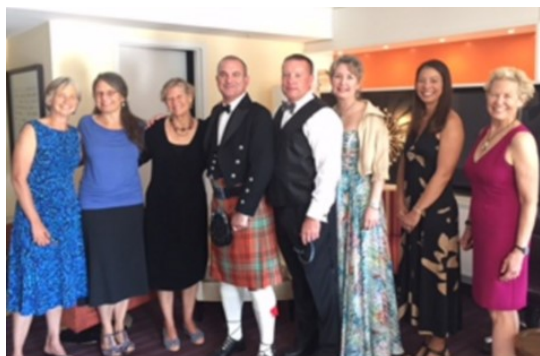
IOOS Directors attend Capitol Hill Ocean Week (CHOW)