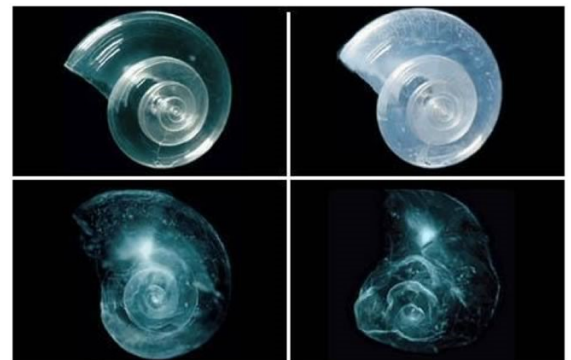
A sea butterfly (pteropod) shell was placed in seawater with increased acidity and the shell slowly dissolves over 45 days.